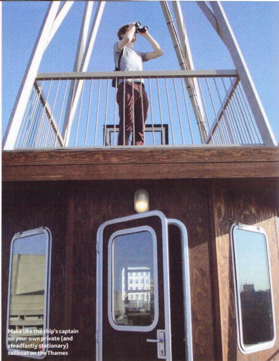
Make like the ship's captain on your own private (and steadfastly stationary) sailboat on the Thames